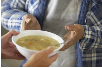
Lenten Soup Suppers!

National Lutheran Schools Week will be March 4 - 10, 2012.